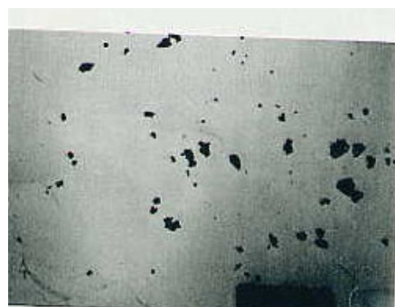
Figure 5. TEM bright field image for a crystal of high concentration with enhanced magnification.