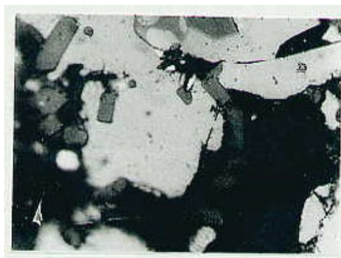
Figure 2. Optical micrographs showing the surface of the crystal with different facets (500X resolution).