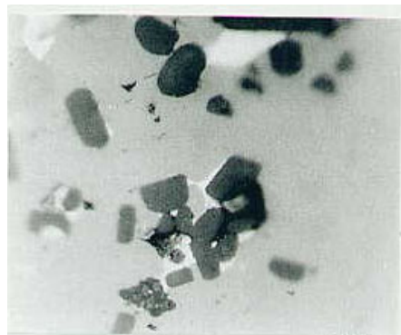
Figure 3. Surface morphology of the crystal with increase in crystallite size (500X resolution).