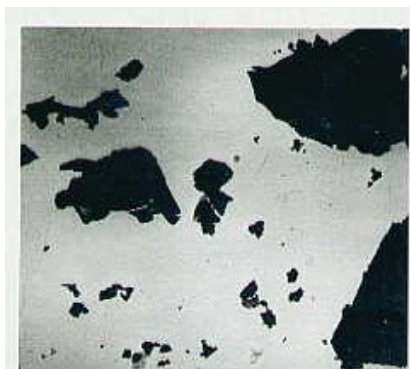
Figure 4. TEM bright field micrograph showing the (100nm) size of particles with uniform texture (defect free surface with nucleation sites for x = 0.25 ).