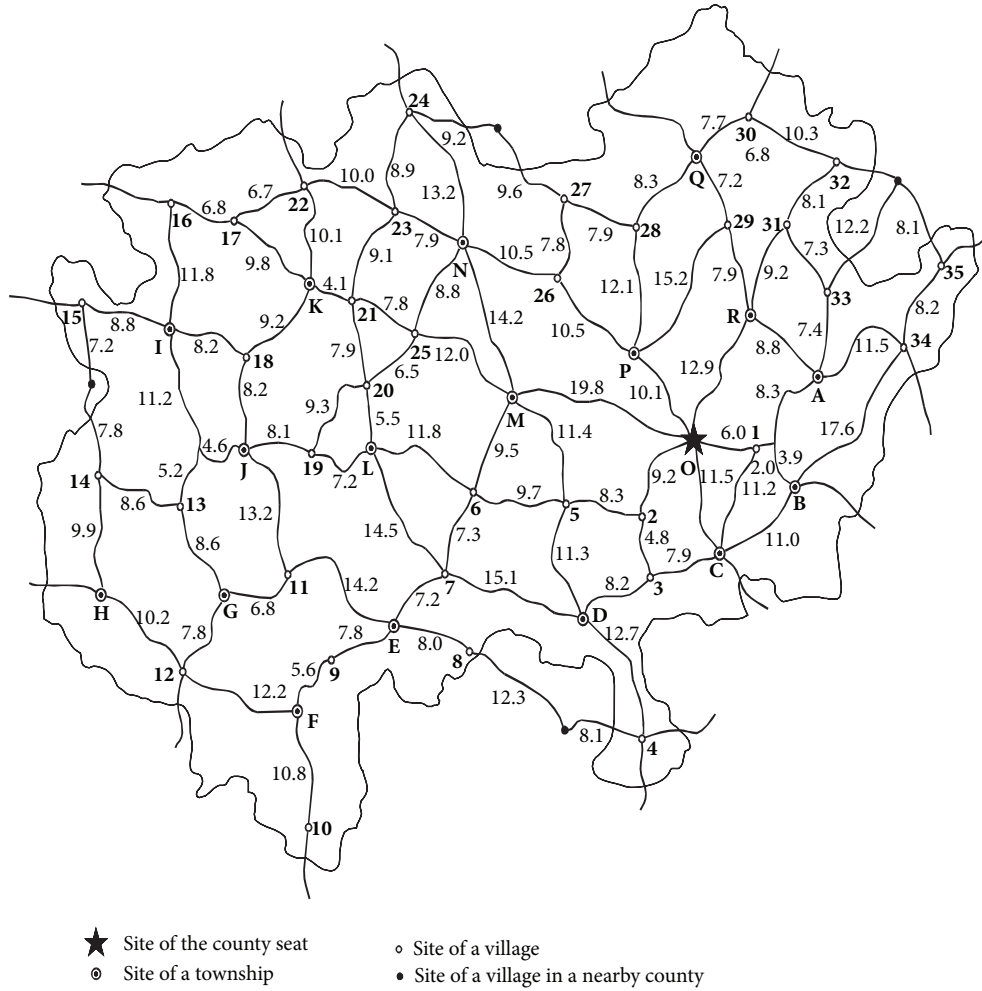
FIGURE 1: The sites in the case study.