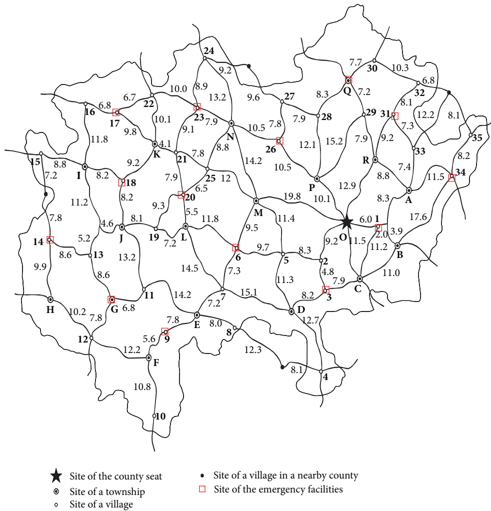
FIGURE 3: Locations of the emergency facilities in the case study with a maximum time limitation.